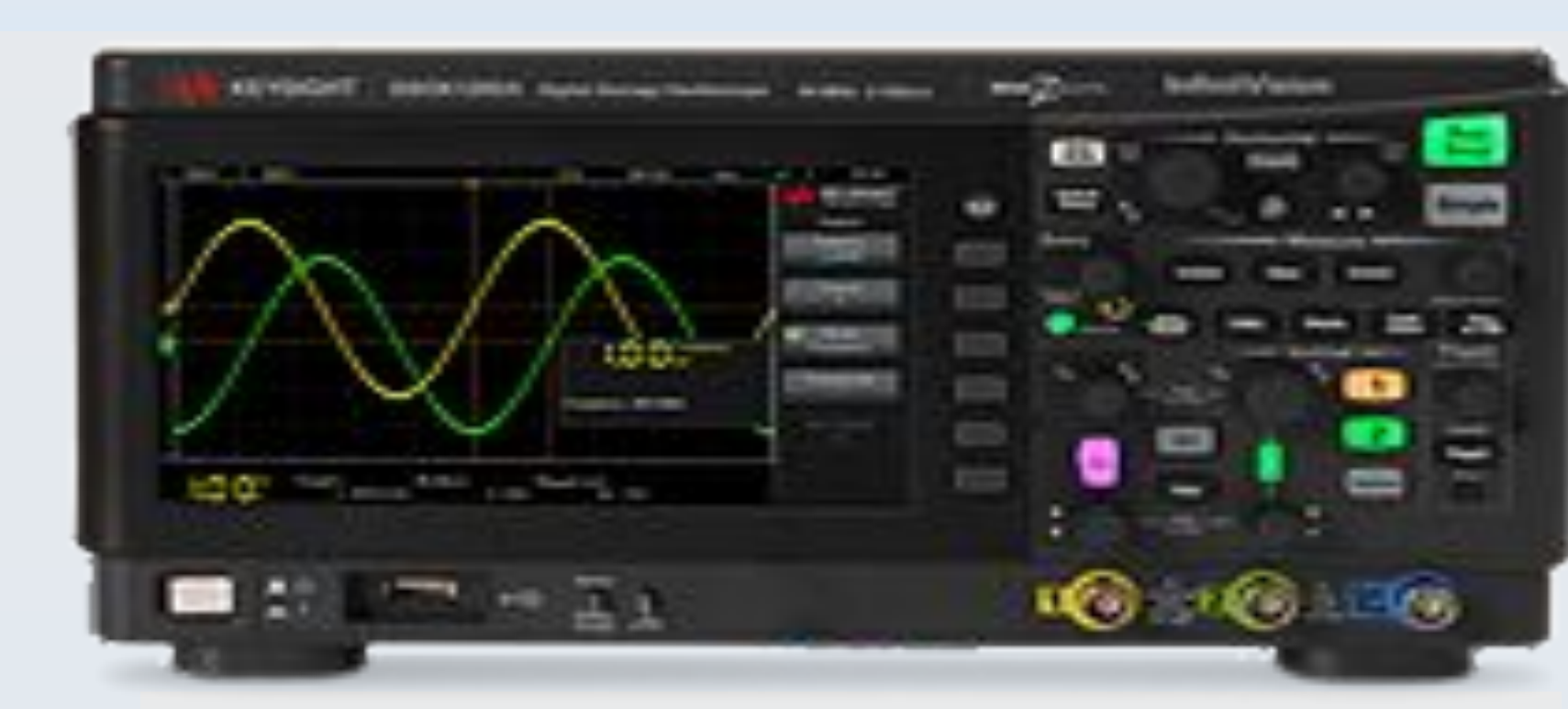
Digital Storage Oscilloscope