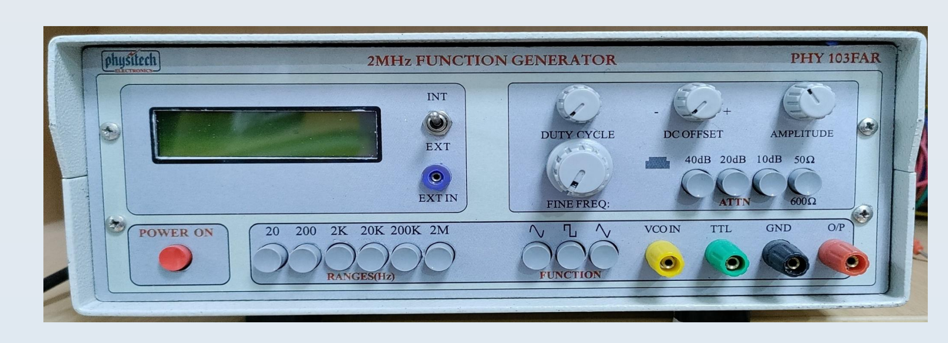
Function Generator - 2 MHz