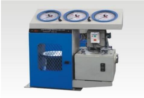
COMPRESSION TESTING MACHINES WITH THREE GAUGE