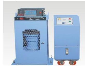
AUTOMATIC COMPRESSION TESTING MACHINE (LOAD/ STRESS CONTROL)