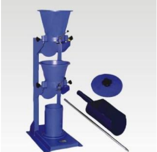
VEE BEE CONSISTOMETER