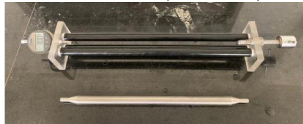
DILATOMETER FOR AUTOGENOUS SHRINKAGE (ASTM C469)