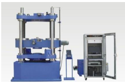
FULLY AUTOMATIC SERVO CONTROLLED UNIVERSAL TESTING MACHINE