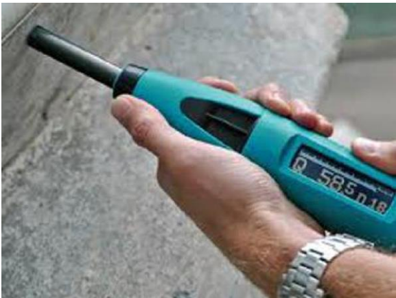
DIGI SCHDMIT HAMMER