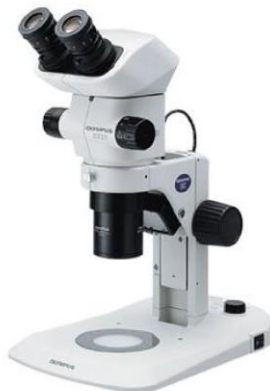
STEREOMICROSCOPE LAMINAR AIR FLOW SETUP (OLYMPUS SXZ7)