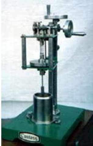
LABORATORY VANE SHEAR APPARATUS