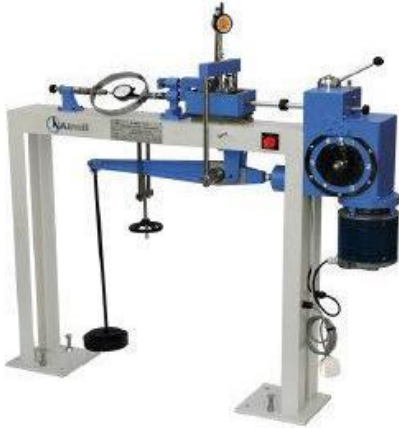
DIRECT SHEAR APPARATUS