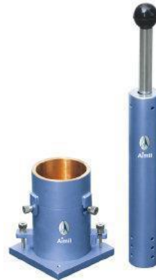
PROCTOR'S COMPACTION TEST