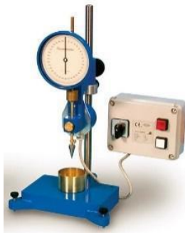
LIQUID CONE PENETROMETER