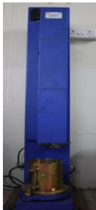
UNIVERSAL AUTOMATIC COMPACTOR