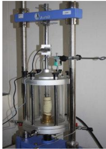
TRIAXIAL TEST APPARATUS