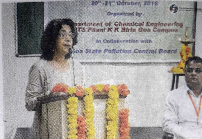
Minister for Science and Technology Alina Saldanha speaking after inaugurating a workshop on 'Environmental Management Systems for Industries in Goa'

Speaking further Saldanha said that "we must harness solar energy and non conventional energy sources for power generation." The minister stressed that more efforts should be taken to preserve and conserve water resources which are otherwise getting polluted due to large anthropogenic activities. She further added that the hotel industry in Goa is expected to address the pollution issue by laying stress not only on legal compliance but on recycling and reusing waste by investing in modern